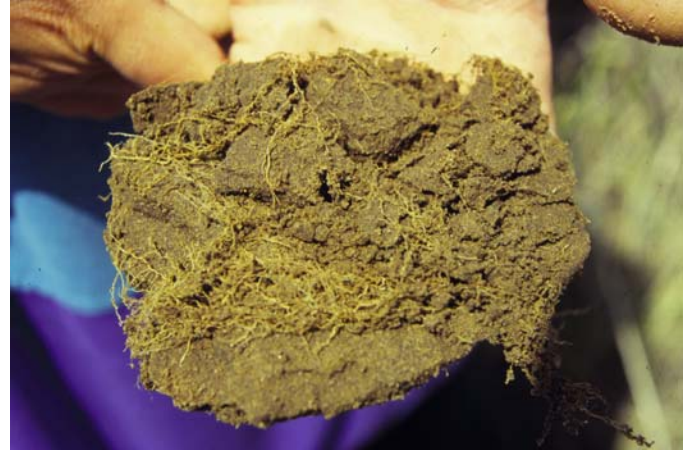
Note the compacted zone below the roots at the bottom of the photo. This compacted soil prevents roots from growing and can prevent water from infiltrating through the soil profile.

soil has more room for roots than soils with bedrock near the surface. These characteristics do not change easily. Dynamic soil quality describes the changes that result from management decisions. For example, soil compaction occurs from the use of heavy equipment under the wrong moisture conditions.