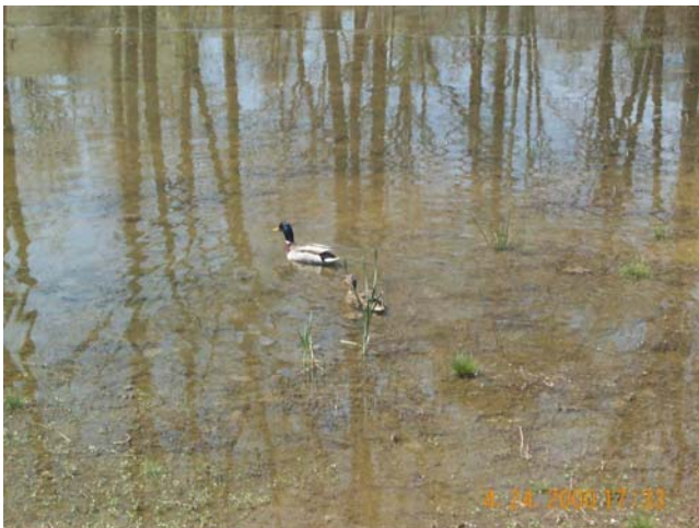
Bay Avenue Basin held water for 35 years prior to soil restoration. Soil was unable to function with standing water 365 days a year.

Stormwater basins are impoundments or excavated basins for the short term detention of stormwater runoff from a completed development area followed by controlled release from the structure at downstream, pre-development flow rates. There are several types of detention devices, the most common being the dry detention basin and the extended dry detention basin. These structures hold and release the water through a controlled outlet over specified time period based on the design criteria. The extended detention basin drains more slowly or may retain a permanent pool of water. Stormwater infiltration basins are facilities constructed within highly permeable soils that provide temporary storage of stormwater runoff. An infiltration basin does not normally have a structural outlet to discharge runoff from a specific design storm. Instead, outflow from an infiltration basin is through the surrounding soil. An infiltration basin may also be combined with an extended detention basin to provide additional runoff storage from both stormwater quality and quantity management.