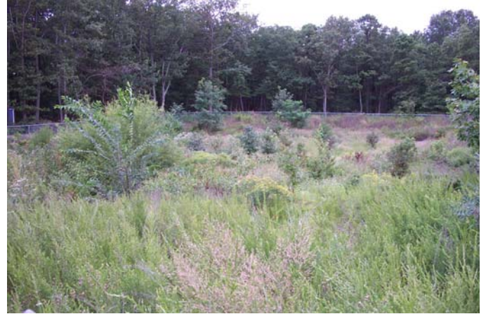
Bay Avenue Basin now drains within 48 hours of a rain event due to the benefits of Soil Health restoration. Water is able to infiltrate through the soil because soil is no longer compacted and vegetation has become established. Ocean County Soil Conservation District has identified 3500 basins within the county.