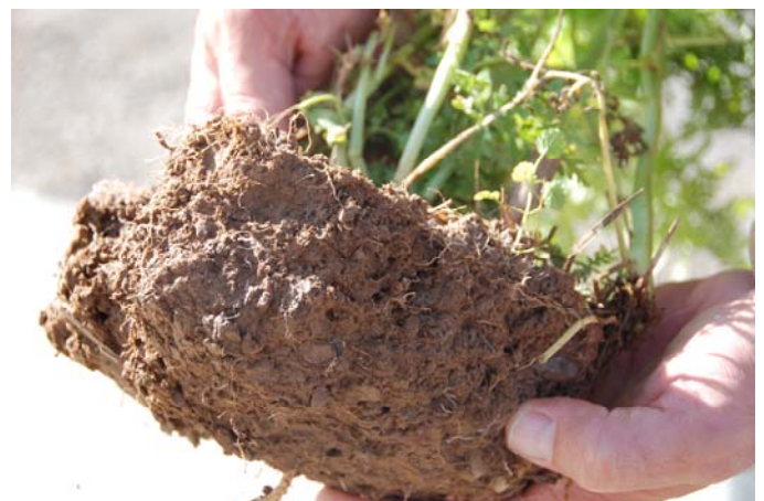
Notice the good root development and abundant pore space. This pore space allows for nutrients and water to flow and be utilized by the plants above ground.

When the soil is disturbed it loses its' natural ability to absorb and infiltrate rainfall making it necessary to collect, channel, store and filter stormwater. Management choices affect the amount of soil organic matter, soil structure, soil depth, water and nutrient holding capacity. Soils respond differently to management depending on the inherent properties of the soil and the surrounding landscape.