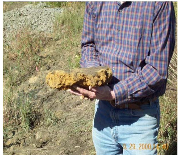
Soil in this basin has been compacted due to improper construction methods that led to this basin retaining water and causing subsequent compaction from the sheer weight of the water column.